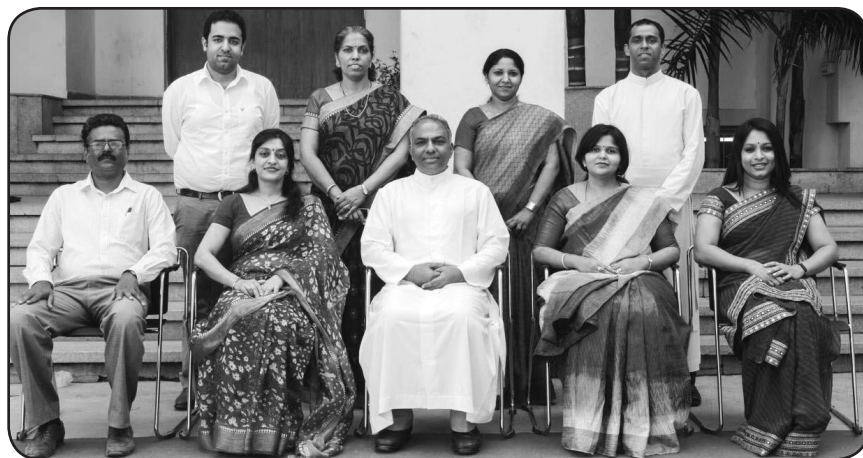
TQM Team of SJCC

The IQAC holds meetings where discussions on the strategies and plans of action to execute and deliberate matters of academics, examination, Co/ Extra/Extension activities and sports take place. The meetings also lay down the parameters and benchmark of quality that is expected from the regulatory bodies like MHRD, UGC, NAAC, and Bangalore University. Evaluation of decisions made with respect to admissions rules and regulations and other administration procedures are also discussed and reviewed.