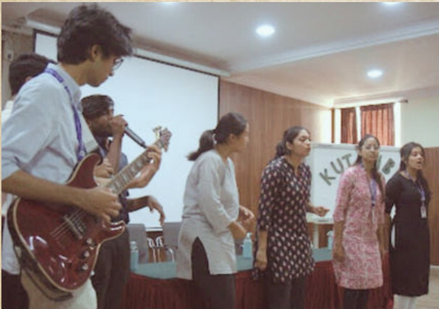
Performance by the Western Music Team.