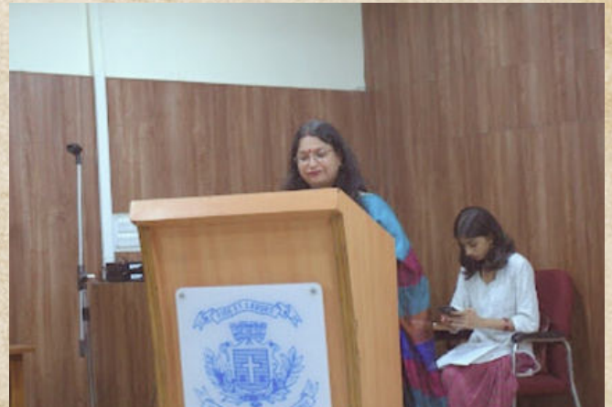
HOD, Economics' address to the gathering.