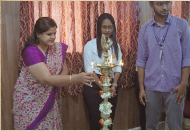
Dignitaries lighting the lamp.