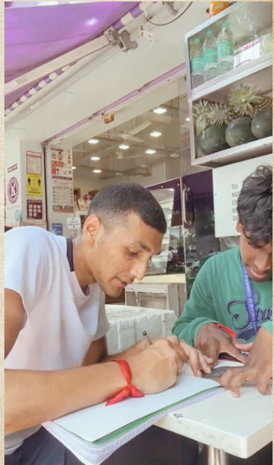
A team solving a clue outside campus.