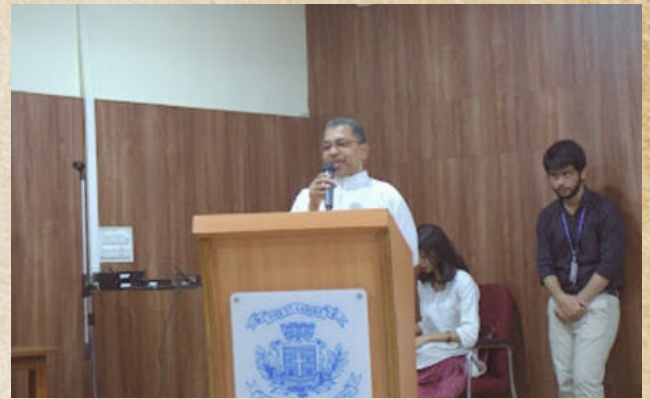
Principal's address to the audience.