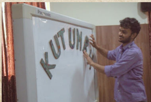
The student coordinator opening the fest.