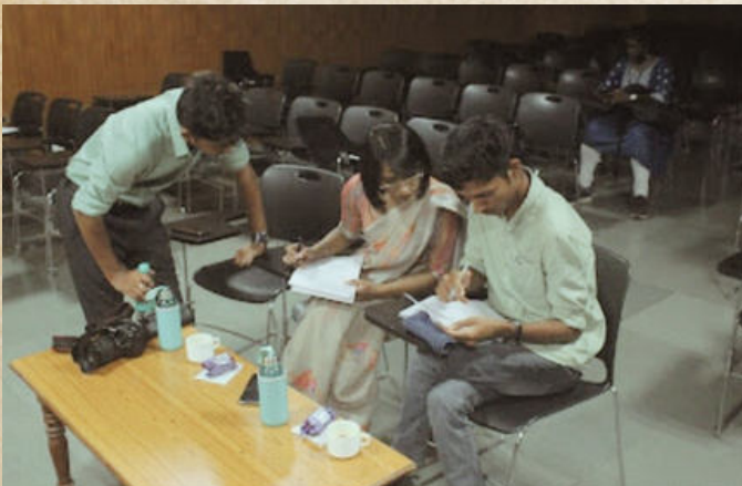
Judges evaluating a participant

The event was completed in a span of 3 to 4 hours, with a break in between for the participants and judges to have their lunch and to take rest.