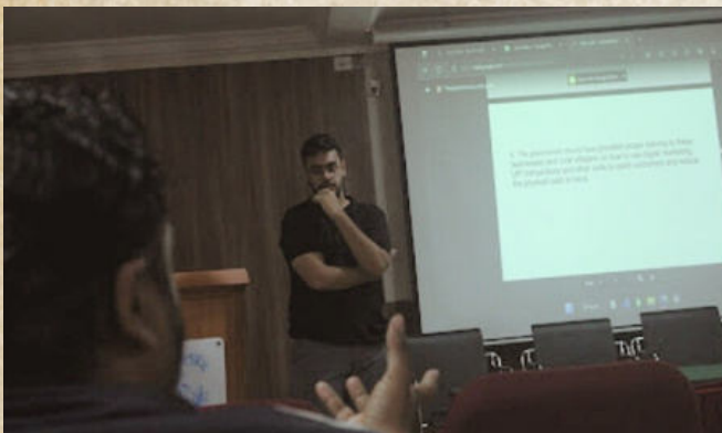
A team presenting their proposal to the judges, as they ask follow-up questions.