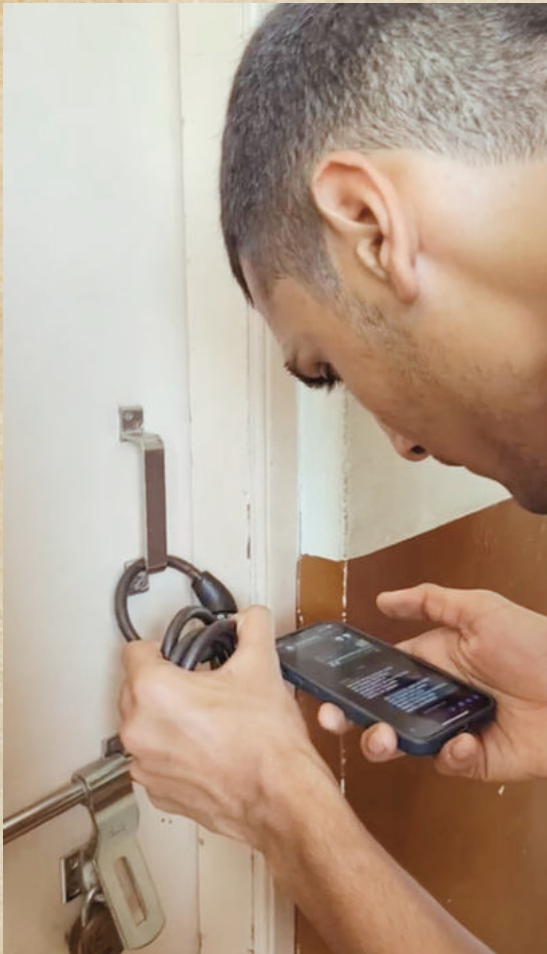
A participant solving the final puzzle.