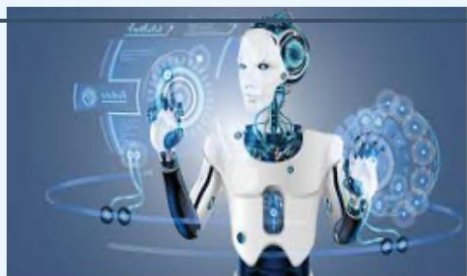
Robotic process automation