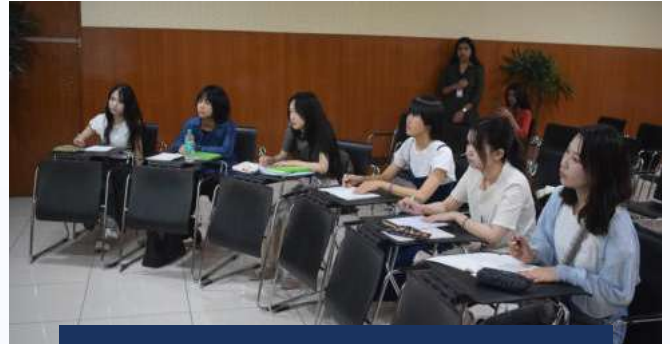
International Cultural Exposure Programme