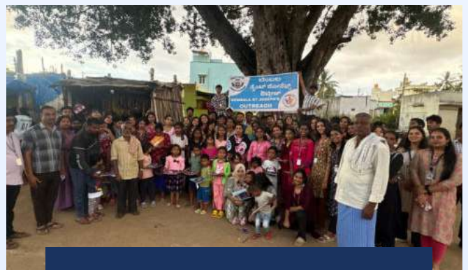
Outreach & Extension Activities (Community Service, Social Visits, etc.)