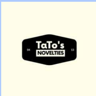
NATASHA SAKSHI 3 BBA B