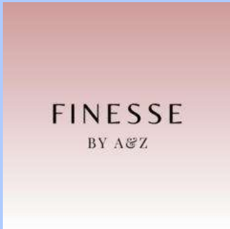
AFIFA RAHIM 2 BBA B