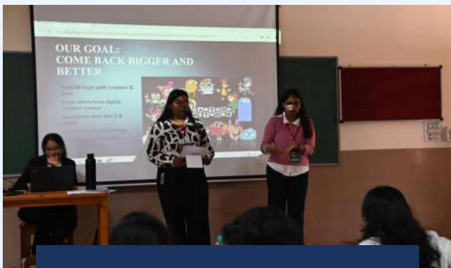
Fests and Competitions