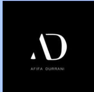
AFIFA DURRANI 2 BBA D