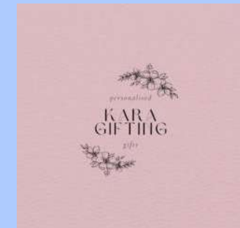
SNEH BOTHRA 3 BBA A