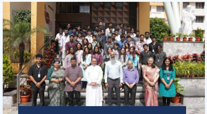
International Summer Schools / Short Term Immersion Programmes