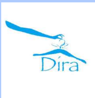
DITI TALESRA 3 BBA D