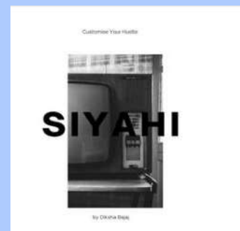
DIKSHA BAJAJ 3 BBA A