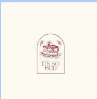
DISHA C A SIHI 1 BBA D