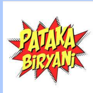
ZAID AHMED 2 BBA D