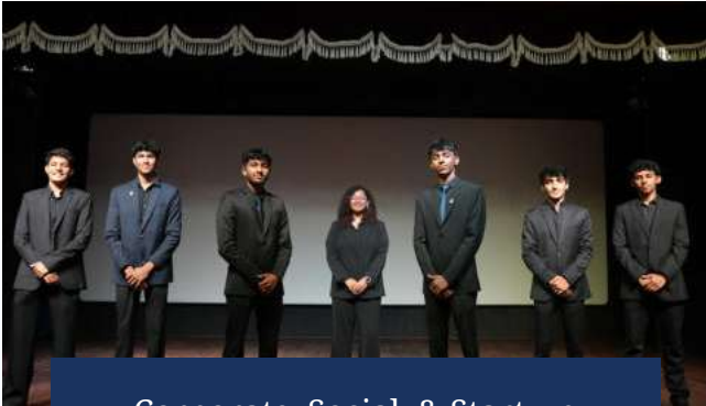
Corporate, Social, & Start-up Internships