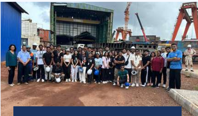
National & International Industrial Visits