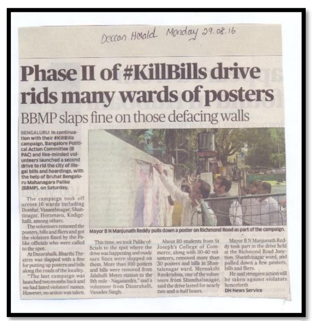
Newspaper reports of KillBill drive conducted by students.