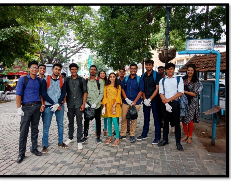
Students taking part in cleanliness drive