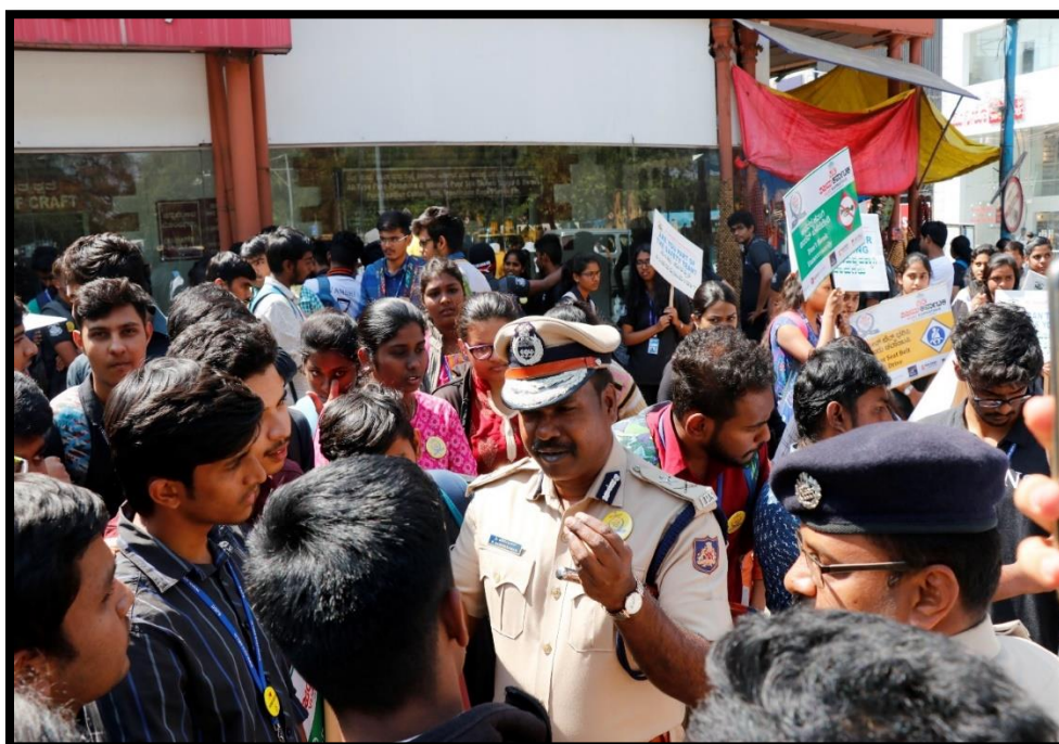
Students of SJCC interacting with Bangalore Traffic Police personnel during 'Traffic Awareness Campaign'

Traffic Awareness drives, students assist Traffic Police Officers maintain smooth flow of traffic at signals around Bengaluru's Central Business District. This not only increases awareness in the students of just how much training and effort goes into managing traffic, but also works to increase awareness in them of responsible driving and riding on the roads.