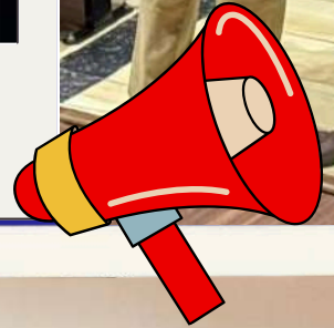
Orientation for 1st years