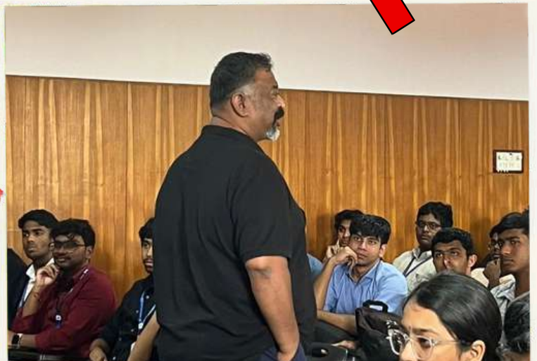
2nd and 3rd years